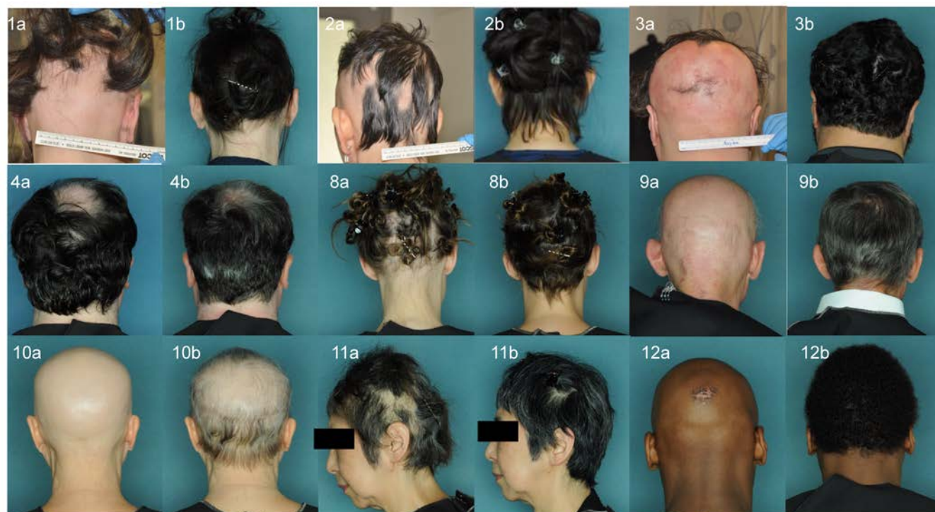
Figure 2. Clinical photographs of responder AA patients on ruxolitinib. Pairs of photographs for subjects 1, 2, 3, 4, 8, 9, 10, 11, and 12 are shown as labeled. Photographs labeled “a” in each pair were taken at baseline, and those labeled “b” were taken at the end of treatment with ruxolitinib.

taken at baseline and following 12 weeks of treatment, with additional optional biopsies performed earlier in the treatment course. Baseline scalp samples exhibited a distinct gene expression profile when compared with samples taken from unaffected patients (Figure 3A and Supplemental Table 2). Following ruxolitinib treatment, gene expression profiles of AA patient scalp samples clustered more closely with healthy control scalp samples than with baseline AA samples (Figure 3B), indicating global normalization of the AA pathogenic response. Gene expression profiles attributed to the IFN, CTL, and hair keratin (KRT) signatures were assessed in the trivariate AA disease activity index (ALADIN, Figure 3C), a summary index of the AA pathogenic inflammatory response and hair regrowth (8). Importantly, eventual AA responders clustered together on the ALADIN matrix at baseline, sharing high IFN and CTL scores (Figure 3, C and D).